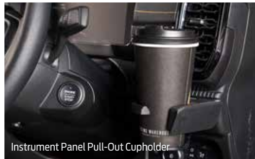
Instrument Panel Pull-Out Cupholder