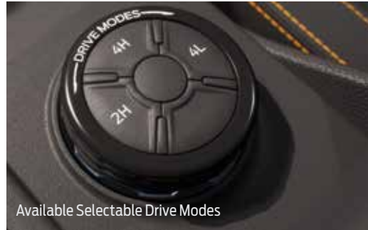
Available Selectable Drive Modes

Take voice-activated SYNC® 4 1 with wireless Apple CarPlay® and Android Auto™ compatibility. 2 Navigate and control your apps on the available 10.1" or 12.1" touchscreen 1 or by using simple voice commands. This large integrated touchscreen puts control at your fingertips, while a new digital instrument cluster lets you customize the information you want to see. The available Selectable Drive Modes work effortlessly for on-the-fly confidence over all terrains. Plus, the available Dual-Zone Climate Control separates cabin temps for driver and front passenger, while available wireless charging 3 allows you to charge your compatible smartphone without using a cable.