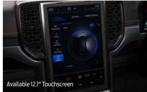
Available 12.1" Touchscreen