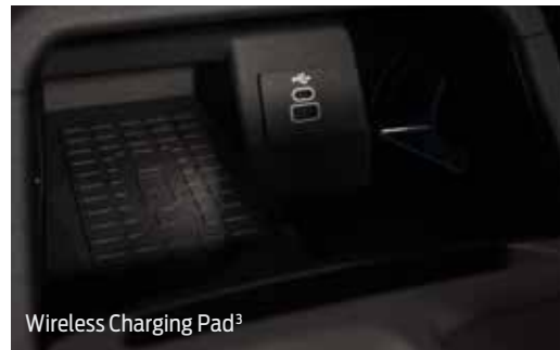
Wireless Charging Pad 3