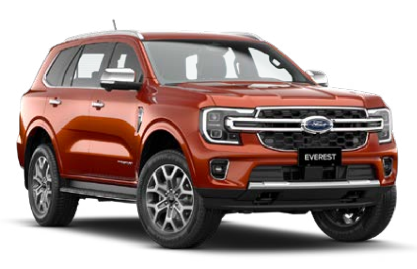
More sophistication and intelligence for every journey.