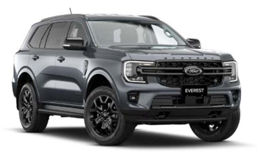
Ready to take you on adventures and look great doing it.