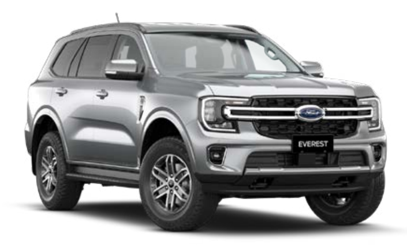
Ruggedly stylish, smart and safe, and ready for it all.